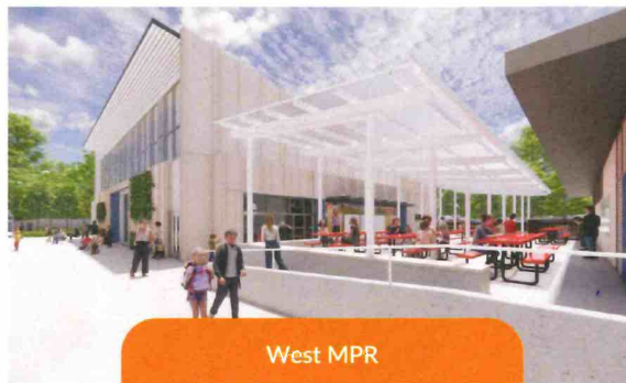
Artist's Rendering: Designs are subject to change as the process progresses

For updates on all Measure H projects—including those under construction, in planning, or already completed—visit the newly launched Measure H webpage. This platform offers a comprehensive overview of HCSD's progress and commitment to creating secure, energy-efficient, and innovative learning spaces that align with our educational goals and community needs.