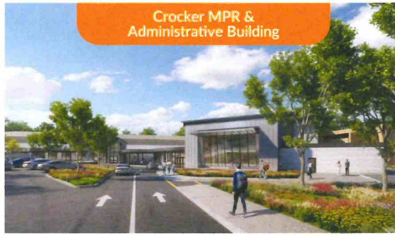
Artist's Rendering: Designs are subject to change as the process progresses

We are also thrilled to announce upcoming improvements at West School, including a new state-of-the-art Multi-purpose Room (MPR) designed to serve as a dynamic space for school events and activities. This new space will feature basketball and volleyball courts, a large stage for student performances, storm drainage upgrades, and an optimized kitchen layout.