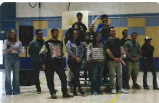
Class of 2000 Time Capsule Opening

Another highlight of the season was the Crocker Time Capsule reveal. The event brought back fond memories as members of the Class of 2000 returned to share recollections and help identify the capsule's contents, sealed for twenty-five years. Let's just say the elements weren't particularly kind to the contents, though surprisingly, the VHS tape held up better than expected!