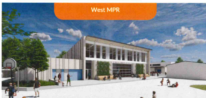
Artist's Rendering: Designs are subject to change as the process progresses